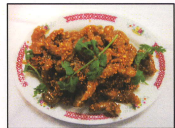
Honey Garlic Chicken $7.00