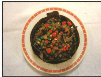
Kin Wah Soft Tofu $7.00