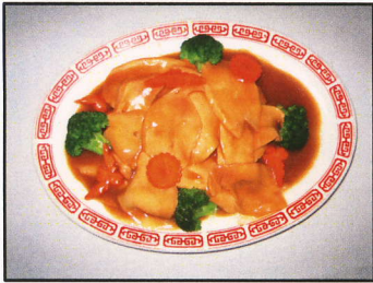
Slice Abalone w/ Fried Tofu $15.50