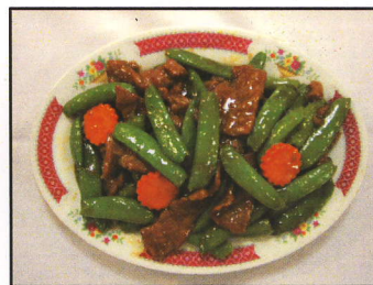
Beef or Pork Sugar Peas $7.25