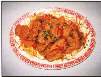
Pepper Salt Pork Chop $9.00