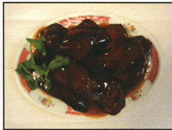
Stuffed Eggplant $7.25