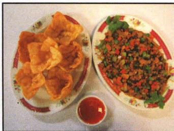
Crispy Shell Basket $7.50