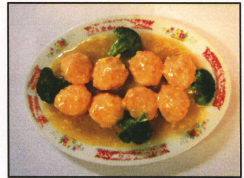
Shrimp Ball with Egg $10.00