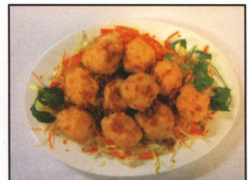
Fried Shrimp Ball w/Garlic $10.50