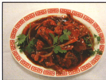
Capital Pork Chop (Sweet/Sour) $9.00