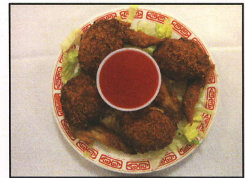
Stuffed Chicken Wings $7.00