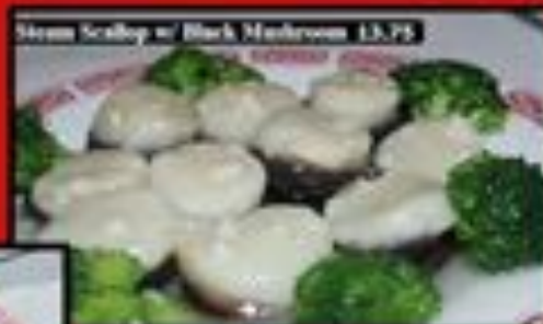
Steak Scallop w/ Black Mushroom 13.75