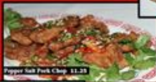
Pepper Salt Pork Chop 11.25