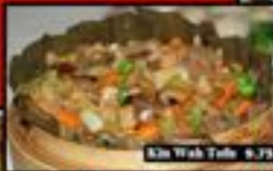
Kuo Wah Tofu 9.75