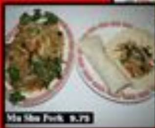
Ma Shu Pork 9.75