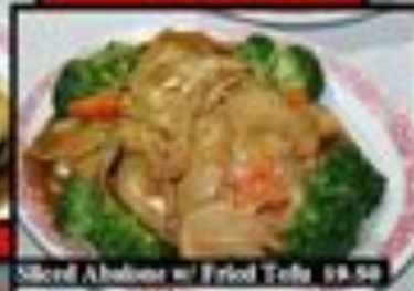
Sliced Abalone w/ Fried Tofu 19.50