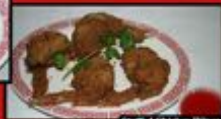
Stuffed Chicken Wings 9.25