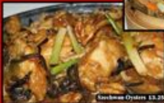
Szechuan Oysters 13.25