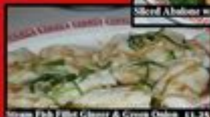
Steam Fish Fillet Ginger & Green Onion 11.25