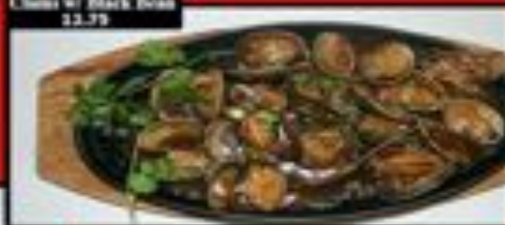
Chow w/ Black Bean 12.75