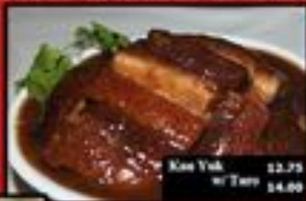
Kao Yuk 12.75 w/ Tofu 14.00