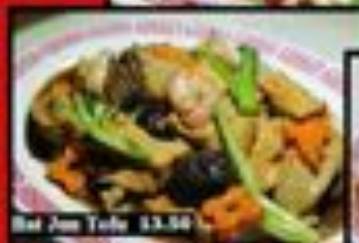
Hot Jon Tofu 13.00