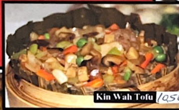
Kin Wah Tofu 10.50