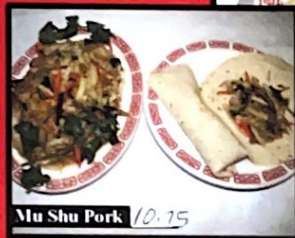
Mu Shu Pork 10.75