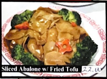
Sliced Abalone w/ Fried Tofu 22.00