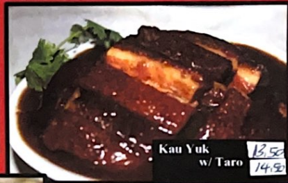
Kau Yuk w/ Taro 13.50 14.50