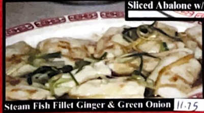
Steam Fish Fillet Ginger & Green Onion 11.75