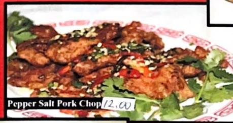
Pepper Salt Pork Chop 12.00