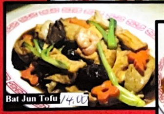
Bat Jun Tofu 14.00