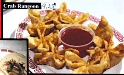
Crab Rangoon 9.25