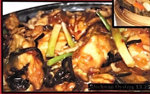
Szechwan Oysters 13.25