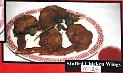
Stuffed Chicken Wings 10.25