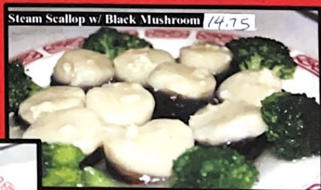
Steam Scallop w/ Black Mushroom 14.75